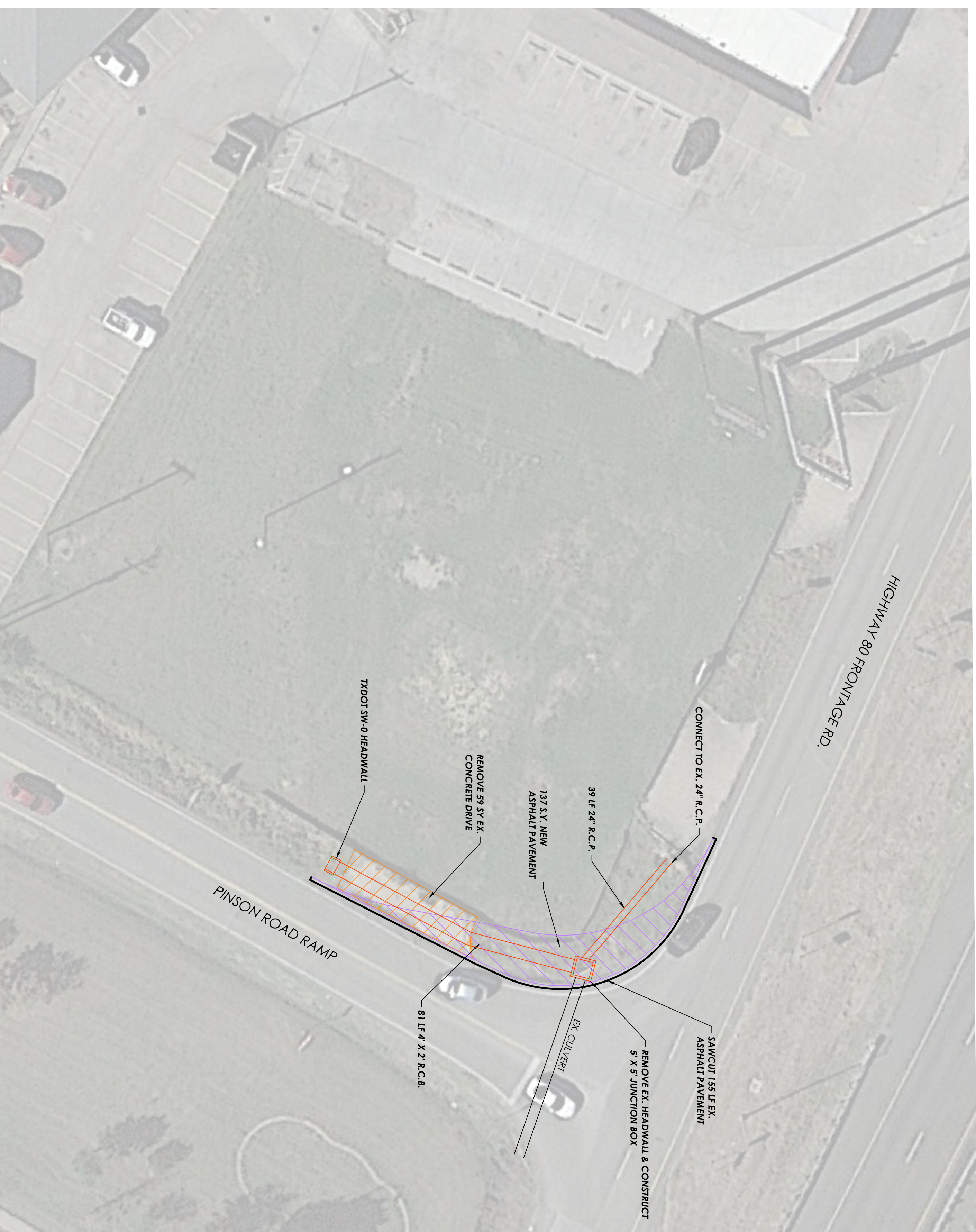
EXHIBIT B SCOPE OF WORK